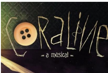
Artwork for Coraline

Neil Gaiman's award-winning novel is finally coming to the stage! Recommended for audiences aged nine and above, they're invited to explore the darkly imaginative world where heroine Coraline encounters the sinister "Other Mother". It'll receive its world premiere at Leeds Playhouse before embarking on a short tour to Manchester, Birmingham, and Edinburgh.