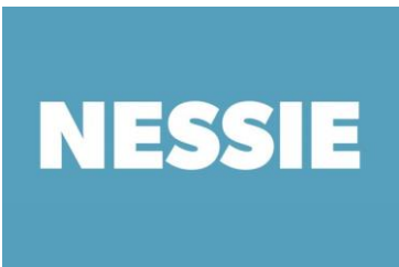
Artwork for Nessie

Honestly, we're surprised that it has taken this long for a musical about the Loch Ness Monster to reach U.K. stages. But with book, music, and lyrics by Shonagh Murray, Nessie will audiences take the plunge into the rich waters of a fantastical tale of a monster revealed to the wider public. Pitlochry Festival Theatre puts remarkably few steps wrong, so this looks very exciting.