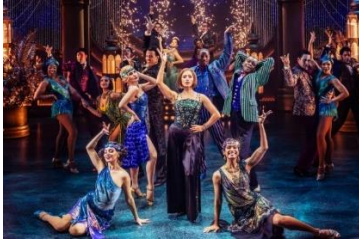
Samantha Pauly (centre) and the Broadway cast in The Great Gatsby

The Tony Award-winning new musical has had the green light and is transferring to London. Based on F Scott Fitzgerald's 1925 novel about a self-made millionaire and his quest for the American Dream, on Broadway the show starred Jeremy Jordan and Eva Noblezada so we can't wait to see who'll be roaring on stage over here, old sports.