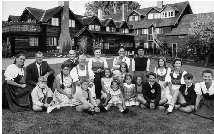
(Real von Trapp Family)