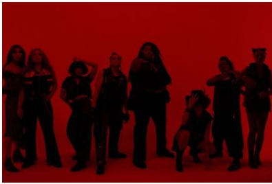
The Warriors

Speaking to the New York Times , Lin-Manuel Miranda has revealed that his and Eisa Davis' hit musical Warriors is likely to find a stage life soon. As he plugs the music for the new Mufasa film, currently in cinemas across the globe, Miranda talked about other projects in the pipeline – including the hit concept album based on the cult classic film The Warriors . The album received a full five-star write-up from WhatsOnStage earlier this year, and you can hear it being discussed on the WhatsOnStage Podcast. Discussing the album's success, Miranda teased some plans to bring it to the stage, saying, "I think at the top of the year, Eisa and I will just start having conversations about how to adapt [ Warriors ] to the stage." Miranda has said that part of the reason for this is because the world is a "visual culture". Dates, venues and possible timespans for the stage version haven't been disclosed, but we're incredibly excited to see what might be in the works. Warriors is inspired by the 1979 Paramount Pictures film and the novel of the same name by Sol Yurick. Described as an "immersive listening experience," the story follows a New York City gang from Coney Island to the Bronx and back when they're framed for the murder of a respected gang leader. It can be streamed now.