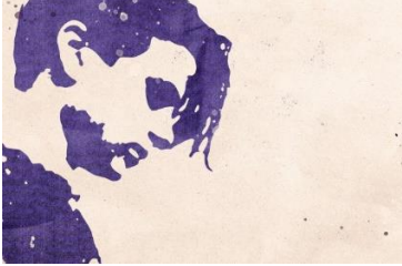
Artwork for White Rose: The Musical