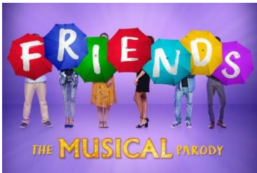
Artwork for Friends! The Musical Parody