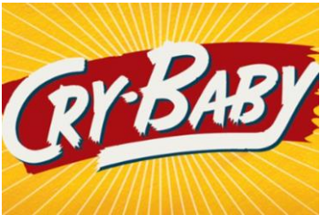
Artwork for Cry-Baby