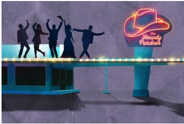
The Show on the Roof artwork