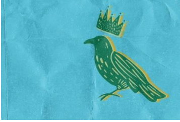
King of Pangea artwork