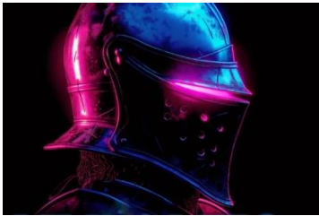
Artwork for A Knight's Tale The Musical

Get your joust on – the world premiere of A Knight's Tale will take place in Manchester in 2025. Based on the film, it follows a 14th-century peasant squire, William Thatcher, who breaks all the rules when he passes himself off as a nobleman in the hopes of becoming the world champion of jousting. The new comedy will feature chart-topping hits, to make for a fun knight, sorry, night, at the theatre.