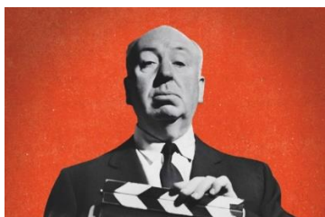
Alfred Hitchcock