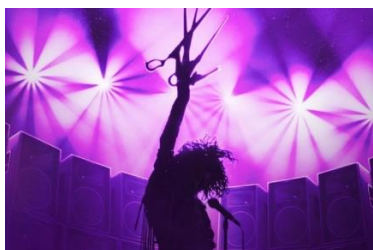
Artwork for Scissorhandz