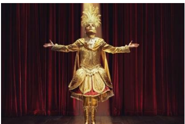
Artwork for Stiletto

The Robert Stigwood Organisation will usher this 18th century musical, set in Venetian high society, to the stage next spring. The writing team features Matthew Wilder ( Mulan ), who provides the music and lyrics, and Tim Luscombe ( Easy Virtue ), who penned the book. It is grounded in the historical phenomenon of castrati, which isn't something you'd normally expect to find a show about.