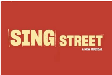
The artwork for Sing Street: A New Musical