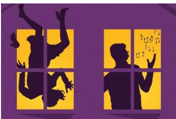
Artwork for Lovestuck