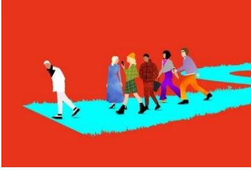
Artwork for Here We Are