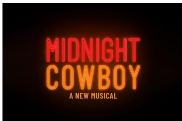
Artwork for the Midnight Cowboy musical