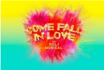
The artwork for Come Fall in Love the DDLJ Musical

Hit romcom and India’s longest-running blockbuster movie Dilwale Dulhania Le Jayenge , also known as DDLJ , is adapted into the rechristened musical Come Fall in Love – directed by Aditya Chopra, with book and lyrics by Nell Benjamin, music by Vishal Dadlani and Sheykhav Ravjani and choreography by Rob Ashford. Expect major production values, Bollywood mashed up with musical theatre.