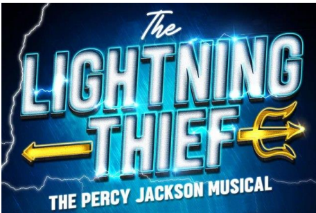
The Lightning Thief: The Percy Jackson Musical, artwork supplied by the production

Calling all demigods! The UK premiere of The LIGHTNING THIEF: THE PERCY JACKSON MUSICAL is almost upon us. For those unfamiliar with Rick Riordan's series of best-selling novels, Percy Jackson and the Olympians , think Harry Potter but infuse it with the famous gods and monsters of Greek mythology. Our young trio of heroes in this case include the son of Poseidon, the daughter of Athena and a satyr. (The Other Palace in London, 23 November 2024 to 2 February 2025.)