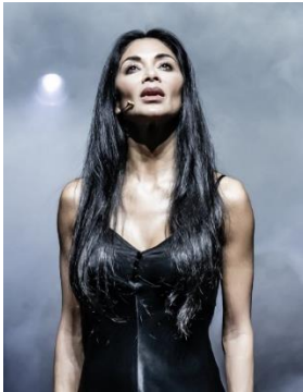
Nicole Scherzinger in the London production of SUNSET BLVD

Andrew Lloyd Webber is back on Broadway—as if he never said goodbye—and, after the downtown sensation of CATS: THE JELLYCAT BALL , it's like he's cool again, y'all. Visionary director Jamie Lloyd offers up a stripped-back, smoky treatment of the sumptuous opera-musical about a faded Hollywood star longing for her glory days. By all accounts, Grammy-nominated former Pussycat Doll Nicole Scherzinger is an electrifying Norma Desmond. "I cannot wait to come for blood on Broadway," she said in her Olivier acceptance speech earlier this year. Let the bloodletting begin. Previews 28 September / Opens 20 October / St. James Theatre