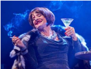
Patti LuPone as Joanne

Patti LuPone picked up the WhatsOnStage, the Tony and the Olivier Awards for her take on Joanne in Marianne Elliot's revival of Company – and it's easy to see why. Classy, profound and slightly menacing, topped off with a show-stopping rendition of "The Ladies Who Lunch", LuPone embodied Joanne masterfully.