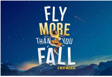
FLY MORE THAN YOU FALL , artwork supplied by the production