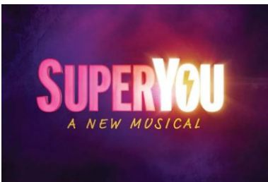
SuperYou , artwork provided by the production