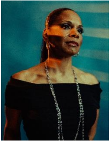
Audra McDonald

It's Audra's turn in Jule Styne, Stephen Sondheim and Arthur Laurents' oft-revived musical about striptease artist Gypsy Rose Lee and the stage mother that made her. Audra McDonald, a six-time Tony-winning stage icon, is taking her crack at the infamous Momma Rose in a new production directed by George C. Wolfe at the newly renovated Majestic Theatre. Wolfe and McDonald previously collaborated on the 2016 Tony-nominated production of Shuffle Along, Or The Making of the Musical Sensation of 1921 and All That Followed , so the pair have a proven track record when it comes to revisiting classics with a modern eye. And as the first Broadway revival to be produced after the passing of all three of its original creators, this GYPSY could have fewer creative constraints than ever before. Previews 21 November / Opens 19 December / Majestic Theatre