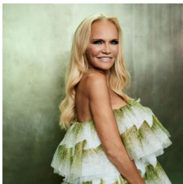
Kristin Chenoweth

The WICKED movie has received the official stamp of approval from OG Galinda, Kristin Chenoweth. After a screening held in New York City on 28 October, Chenoweth gushed from the back seat of her car, "Oh my gosh I just saw the movie and I'm dying. I'm deceased. I'm actually dead. I'm not here. People are not going to be well when they see this film. It is so good. It is so special." She went on to praise the film's director, Jon M. Chu, as well as the whole cast, and of course, its pair of leading witches: "Cynthia (Erivo) and Ariana (Grande) are amazing."