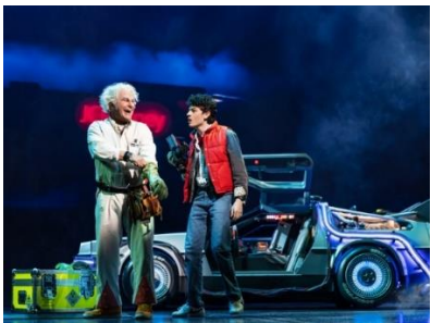
Roger Bart and Casey Likes in Back to the Future

Back to the Future is ending its Broadway ride. The musical, which is based on the hit 1985 film of the same name, will play its final performance at the Winter Garden Theatre on 5 January 2025.