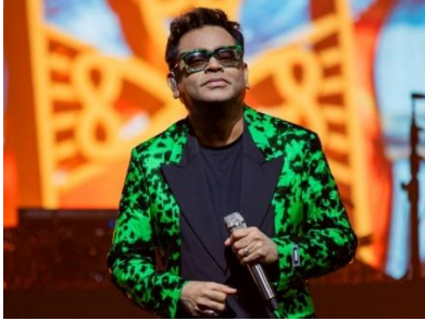
A.R. Rahman