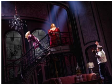
Jennifer Simard, Christopher Sieber, Megan Hilty