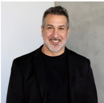
Joey Fatone

Joey Fatone, a Broadway veteran with boy-band credentials, will join the cast of & Juliet on Broadway. He will take on the role of Lance from 21 January 2025 through 16 March at the Stephen Sondheim Theatre. He takes over from Tony winner Paulo Szot who took a leave from the show earlier this year and returned to the company on 16 July. "I'm excited that I'll be joining the cast of & Juliet! " Fatone said. "I can't wait to get out there and sing Max Martin's amazing songs—his hits have shaped so much of pop music. And yes, I know I'll even be singing a couple of Backstreet Boys songs. Even though my loyalty remains with *NSYNC, they still have bangers. See you at the show!"