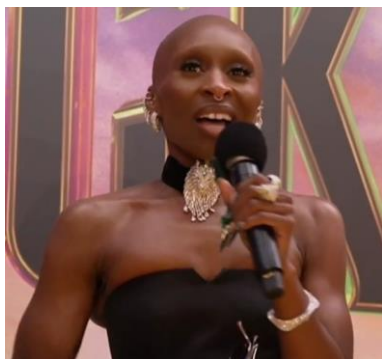
Cynthia Erivo by Our Movie Guide – WICKED – Australian Premiere Interviews via Wikimedia Commons, CC BY 3.0