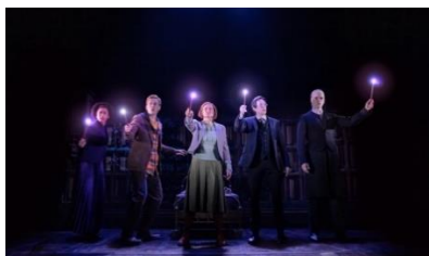
The cast of Harry Potter and the Cursed Child

A new, shorter version of Harry Potter and the Cursed Child is coming to Broadway. The leaner show, which runs under three hours including intermission, will premiere at the Lyric Theatre on 12 November, having made its world premiere in Chicago in September. Broadway rehearsals are underway. The reworked show brings the runtime closer to that of another spooktacular production opening on Broadway this season: Stranger Things: The First Shadow . The show's producers say that the show has lost none of its charms.