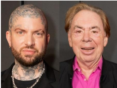
Jamie Lloyd and Andrew Lloyd Webber