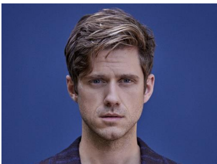
Aaron Tveit

Tony Award winner Aaron Tveit is trading the pie shop for the elegant confines of the Café Carlyle. Tveit, who ends his run as the title character in Sweeney Todd on 5 May, will perform at the celebrated Upper East Side cabaret venue from 18 to 29 June, in his debut residency.