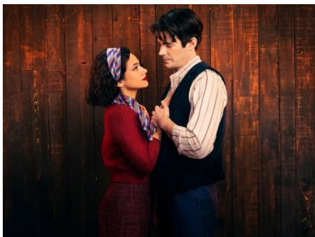
Isabelle McCalla and Grant Gustin in Water for Elephants

Water for Elephants , the new Broadway musical, began performances at the Imperial Theatre on 24 February, with an official opening set for 21 March. Based on Sara Gruen's 2006 novel – which also inspired a 2011 movie starring Robert Pattinson and Reese Witherspoon – Water for Elephants follows Jacob Jankowski, who finds a new home with a travelling circus during the Great Depression. Seen through the eyes of his older self, his adventure becomes a poignant reminder that if you choose the ride, life can begin again at any age.