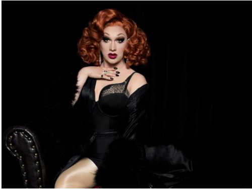
Jinkx Monsoon

Jinkx Monsoon, the American drag queen, actor, singer and comedian, will return to CHICAGO as Matron “Mama” Morton for 20 performances, after making her Broadway debut in the role in 2023. She will perform from 27 June through 12 July at the Ambassador Theatre. Jinkx won the fifth season of RuPaul's Drag Race as well as the seventh season of RuPaul's Drag Race All Stars – the show's only two time winner. Known for her pitch-perfect celebrity impersonations of Judy Garland, Jennifer Coolidge, Bernadette Peters and Little Edie, Jinkx is the first drag queen to play “Mama” Morton on Broadway.