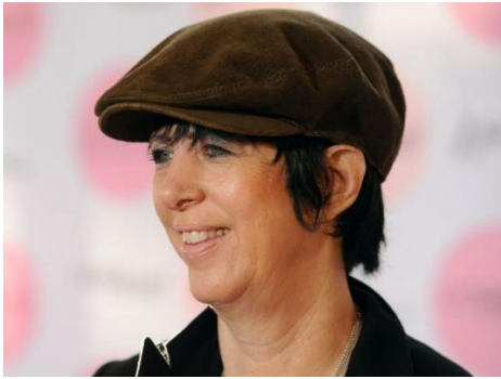
Diane Warren