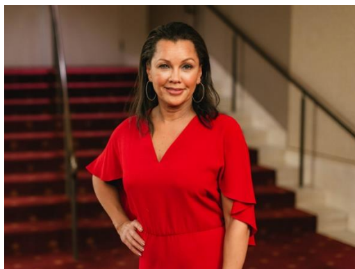
Vanessa Williams

Tony nominee Vanessa Williams will play Miranda Priestly in Elton John’s stage musical adaptation of The Devil Wears Prada in the West End. The show will open on 9 July at Theatre Royal Plymouth before transferring to London’s Dominion Theatre on 24 October. The musical is based on the Lauren Weisberger novel and the movie adaptation of the same name. The film starred Meryl Streep as Miranda Priestly, the terrifying Editor-in-Chief of Runway Magazine, and Anne Hathaway as her wide-eyed assistant Andy Sachs. A former Miss America winner and Desperate Housewives star, Williams was nominated for a Tony for her performance in Into the Woods in 2002. Her other Broadway credits include POTUS and Kiss of the Spider Woman . “Bringing Miranda Priestly to life in the West End is an absolute dream come true,” said Williams in a statement., “Gird your loins, folks.”