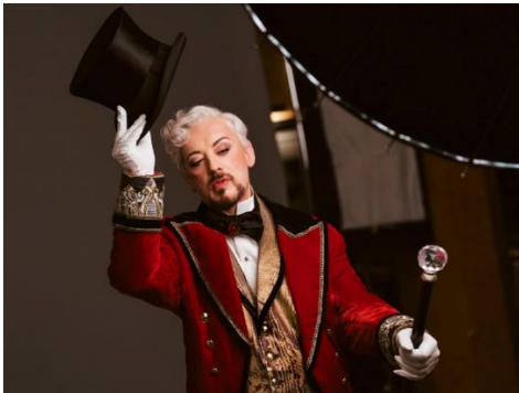
Boy George