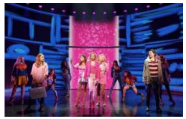
The original cast of MEAN GIRLS on Broadway