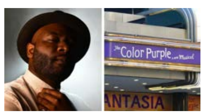
Blitz Bazawule and The Color Purple