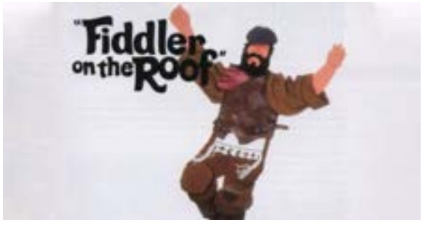
Fiddler on the Roof 30<sup>th</sup> anniversary cover