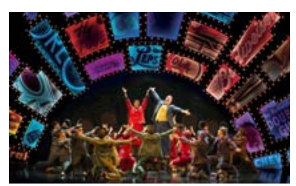
The cast of GUYS AND DOLLS