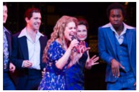
Cassidy Janson (Carole King)