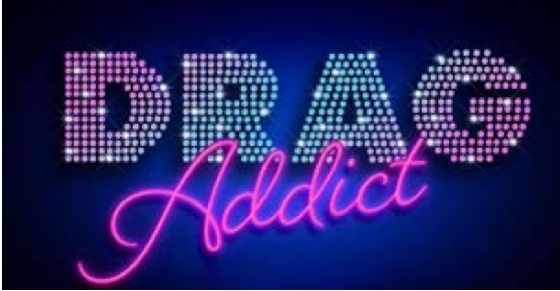
The artwork for DRAG Addict

Arlene Phillips choreographs the new production.