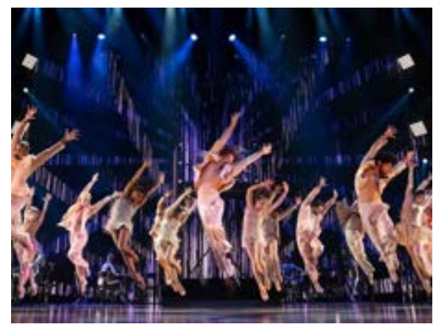
The cast of Bob Fosse's Dancin"