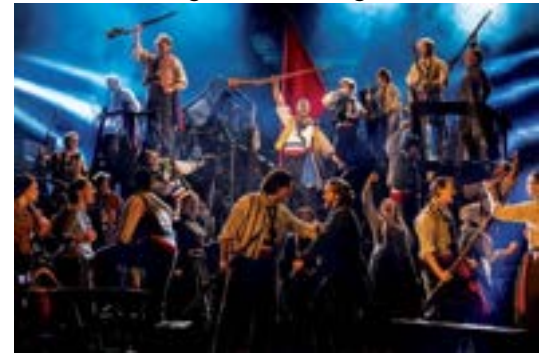
The cast of the West End Production of Les Misérables