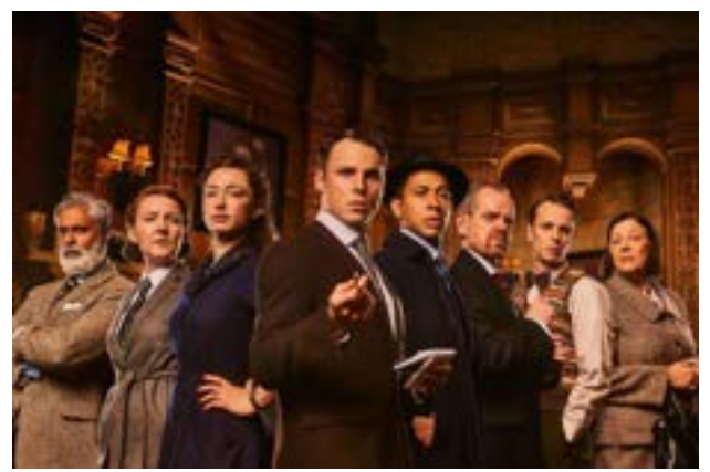
The Mousetrap London Cast

About: The world's must successful and longest running play comes to Broadway for the very first time in a limited engagement.