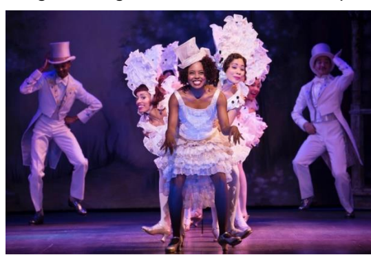
Scene from Shuffle Along

The similarly epic musical Show Boat , which opened on Broadway in 1927, was over three hours long in its original and many of its subsequent productions. The out-of-town tryout of the game-changing musical by Oscar Hammerstein II and Jerome Kern ran over four hours, but the show was trimmed before opening in New York. In order to do justice to the story of Edna Ferber's sweeping novel on stage, a long run time was necessary.