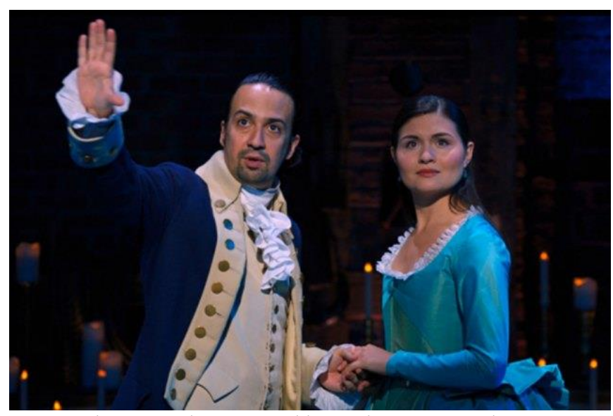
Lin-Manuel Miranda and Phillipa Soo in HAMILTON, © Disney

Disney was to release a sing-along version of HAMILTON . According to Disney, "fans can take a shot at the most complicated verses from the musical by following along with the on-screen lyrics as they watch the film."