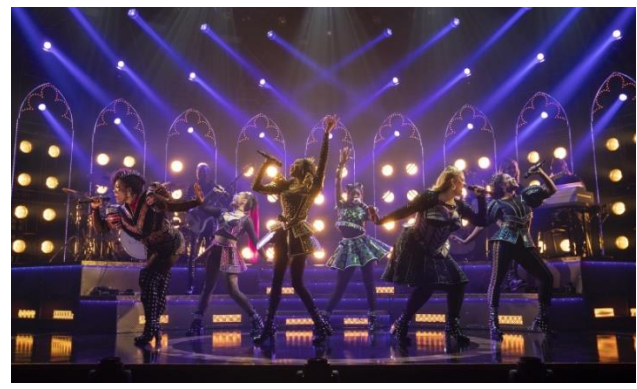
Scene from SIX

At 80 minutes with no intermission, the current production of SIX is one of the shortest musicals in Broadway history. Plenty of Broadway musicals have clocked in at 90 minutes but 80 minutes is a rare occurrence. There are more plays than musicals in Broadway history with run times shorter than 90 minutes.