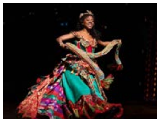
Emilie Kouatchou in Broadway's The Phantom of the Opera

Audiences are flocking to the Majestic Theatre to experience the angel of music. As previously reported, The Phantom of the Opera , the longest running show in Broadway history, has set a final performance date of 18 February 2023. The production packed in crowds to 100.62% capacity and surged from $US964,172 to $US1,205,364 within just one week of announcing the show's closure.