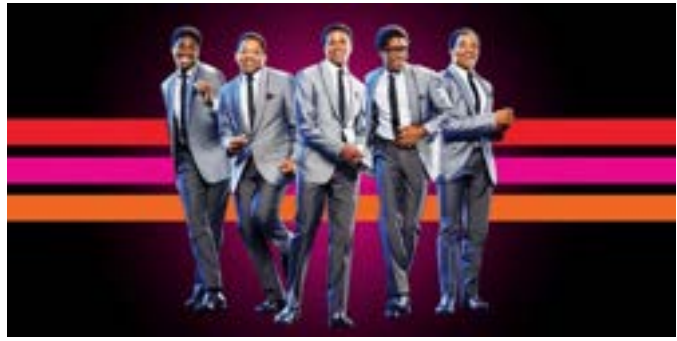
Ain't Too Proud - The Life and Times of the Temptations to open in the West End Sophie Thomas · 29 September 2022

Ain't Too Proud - The Life and Times of the Temptations