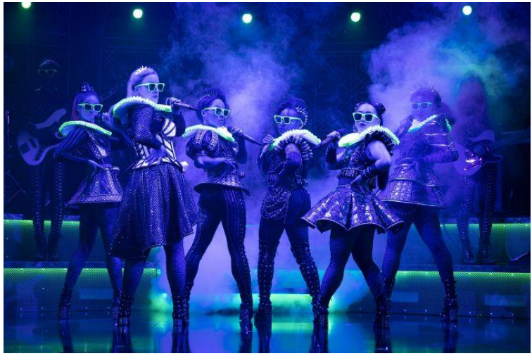
The original Broadway cast of 'Six'