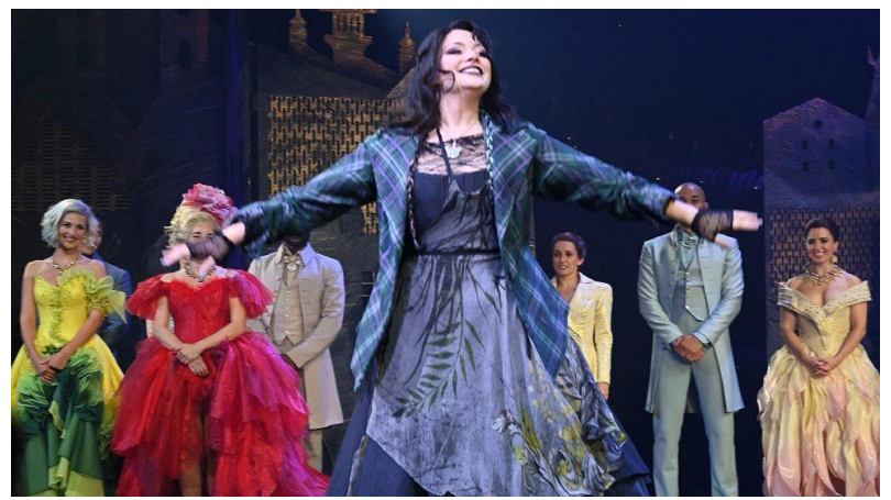
Carrie Hope Fletcher plays the title role in Cinderella - described by critics as having a "snappy contemporary edge"