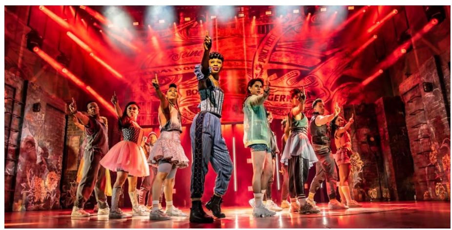
Throw some glitter, make it rain!

The pop musical & Juliet will invite audiences to sing along for one night only in the West End. A sing along performance of & Juliet will take place at the Shaftesbury Theatre on 6 June. During the performance, screens around the Shaftesbury Theatre auditorium will display the lyrics to every song. The & Juliet musical includes hits such as 'Love Me Like You Do', 'Confident' and 'Roar'. "We wanted to create a special occasion where everyone is welcome to join in and have as much fun singing our songs as the actors do every night – when normally we ask the audience to leave the performing to them!" said director Luke Sheppard. "A key message of the show is celebrating inclusivity through the magic of theatre, and our hope is that this event continues to open up this show to new audiences as well as those who want to experience the show in a unique way." Miriam-Teak Lee leads the & Juliet cast as Juliet, joined by The Greatest Showman star Keala Settle as the Nurse, Cassidy Janson as Anne Hathaway, Oliver Tompsett as William Shakespeare, Tim Mahendran as Francois and Alex Thomas-Smith as May, Tom Francis as Romeo and Julius D'Silva as Lance.