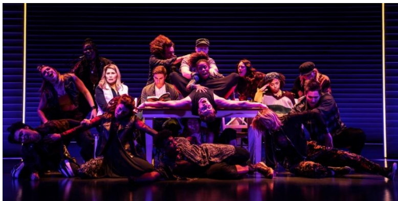
Jagged little pill – Broadway company

You oughta know this musical! The Alanis Morissette jukebox musical jagged little pill will receive its West End premiere later this year. jagged little pill is expected to open in the Autumn, with a theatre and performance dates to be announced. The show will feature the same creatives as the Broadway production and jagged little pill will feature a British cast. The jagged little pill musical follows the Healy family who try to present themselves as a picture-perfect family, but troubling events in the community disrupt their lifestyle.