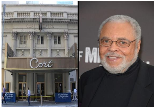
The Cort Theatre and James Earl Jones

The Shubert Organisation has announced that the 110 year old Cort Theatre on West 48 th Street will become the James Earl Jones Theatre in recognition of Jones' lifetime of immense contributions to Broadway and the entire artistic community. A formal dedication ceremony will happen when the theatre's renovations are complete. "For me standing in this very building 64 years ago at the start of my Broadway career, it would have been inconceivable that my name would be on the building today," said Jones in a statement. "Let my journey from then to now be an inspiration for all inspiring actors." Jones has appeared in 21 Broadway productions, including two at the Cort Theatre.