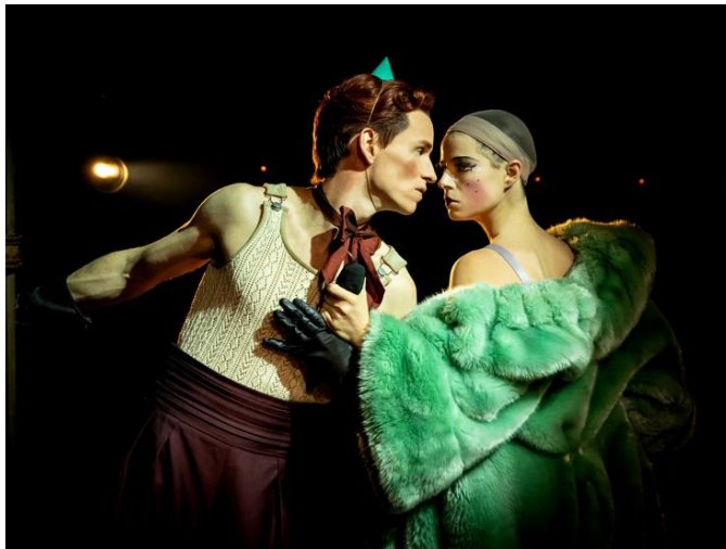
Eddie Redmayne and Jessie Buckley in CABARET

The 2022 Olivier Award nominations were announced on 8 March and a slew of stage favourites are in the running for top prizes. The revival of CABARET , starring Eddie Redmayne and Jessie Buckley, leads with 11 nominations, including Best Musical Revival and a pair of nominations for both Redmayne and Buckley. ANYTHING GOES , headlined by THE MUSIC MAN star Sutton Foster, follows with nine nominations. LIFE OF PI also received nine nominations, including Best New Play. BACK TO THE FUTURE – THE MUSICAL nabbed seven nominations, while the Tony-winning MOULIN ROUGE! THE MUSICAL received five. The Bob Marley musical, GET UP STAND UP! , and Disney's FROZEN each received four. Jason Manford returns to host for the Olivier Awards ceremony which will take place on 10 April at London's Royal Albert Hall. A list of nominations follows;