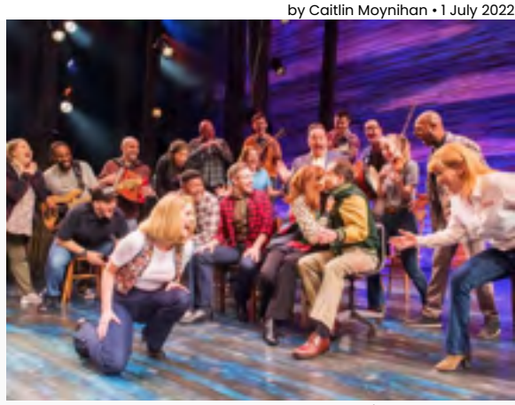
The West End cast of "COME FROM AWAY