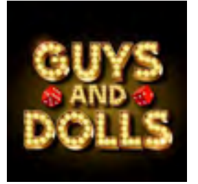
by Shaun Tossell • 17 April 2022

A brand new revival of the classic musical GUYS AND DOLLS is reportedly heading to London in 2023, it has been rumoured. The brand new revival will reportedly be coming to an unexpected theatre.