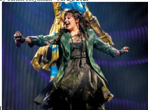
Carrie Hope Fletcher in "Cinderella"