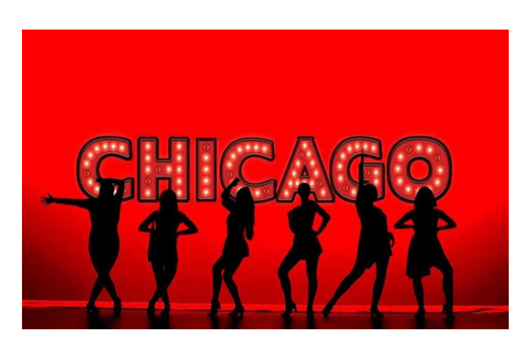
April 2021 (Wallace Development Company Theatre)