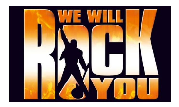
August 2021 (Regent on Broadway)