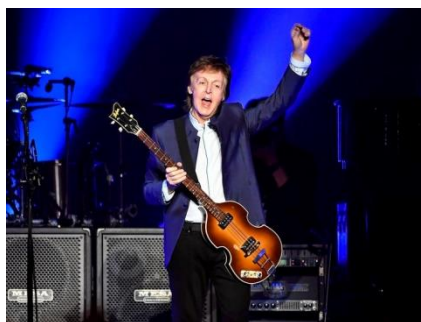
Paul McCartney

Paul McCartney, Grammy and Oscar-winning singer-songwriter and original band member of The Beatles, has crafted a score to a new musical adaptation of the iconic 1946 film It's a Wonderful Life , Variety reports. The musical is expected to make a 2020 world premiere in the U.K. before moving to Broadway. Tony winner and Oscar nominee Lee Hall ( Network , Billy Elliot , Rocketman ) is collaborating with McCartney on the new tuner, with Tony-winning producer Bill Kenwright shepherding the show to the stage. "Writing a musical is not something that had ever really appealed to me," said McCartney. "But Bill and I met up with Lee Hall and had a chat and I found myself thinking this could be interesting and fun. It's a Wonderful Life is a universal story we can all relate to." Famously directed by Frank Capra, the film It's a Wonderful Life centres on everyman George Bailey, who considers ending his life on Christmas. He inadvertently rescues a guardian angel named Clarence who shows him what the world would look like without his contributions. McCartney first launched to fame as bass guitarist and singer with The Beatles. Over the course of his career, he has won 18 Grammys and an Academy Award shared with The Beatles for the score to the documentary Let It Be .