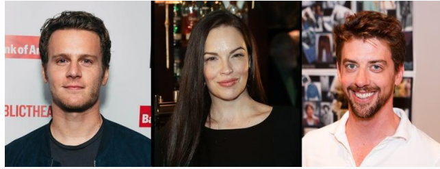
Jonathan Groff, Tammy Blanchard & Christian Borle