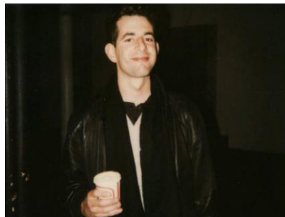
Jonathan Larson