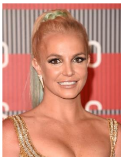
Britney Spears

Audiences will have to wait a little longer for the Britney Spears-scored musical Once Upon a One More Time . The tuner's Broadway-aimed world premiere, originally announced to play the James M. Nederlander Theatre in Chicago from 13 November through 1 December 2019, has pushed back its run to 14 April through 17 May 2020; a press release lists "scheduling issues" as the reason for the delay. As previously announced, Once Upon a One More Time follows Cinderella, Snow White and the other fairytale princesses as they gather for a book-club meeting; soon, a rogue fairy godmother drops The Feminine Mystique into their corseted laps, spurring a royal revelation. The musical features an original book by Jon Hartmere ( The Upside, Bare ) with direction by Tony nominee Kristin Hanggi ( ROCK OF AGES ) and choreography by Keone and Mari Madrid (Justin Bieber's "Love Yourself"; "World of Dance"). The musical will feature Spears' hit pop songs throughout. Casting will be announced at a later date.