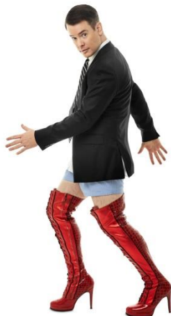
David Cook in a promo shot for Kinky Boots

Tony nominee Constantine Maroulis has been announced to take on the title role in an upcoming production of the musical thriller Jekyll & Hyde . Returning to the role he played in a 2013 Broadway revival, Maroulis will appear alongside fellow American Idol alum Diana DeGarmo as Lucy Harris. Broadway's original Dr Jekyll/Mr Hyde, Robert Cuccioli, will direct the production, slated to run from 25 September through 7 October.