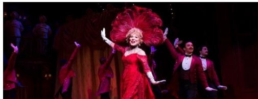
Bette Midler in Hello, Dolly!

Tony winners Bette Midler and David Hyde Pierce return to the Tony-winning Broadway revival of Hello, Dolly! beginning on 17 July. The leading pair will continue with the production until its closing date of 25 August. Midler and Pierce replace Bernadette Peters and Victor Garber, who played their final performance in the musical on 15 July 15. Midler took home a 2017 Tony Award for her turn in the classic musical's title role. Pierce, a Tony winner for Curtains , earned a Tony nom for his turn as Hello, Dolly! 's curmudgeonly Horace Vandergelder.