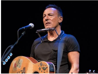
Bruce Springsteen in Springsteen on Broadway

Springsteen on Broadway , the mega-hit Broadway concert engagement that netted a Special 2018 Tony Award for iconic music maker Bruce Springsteen, will launch globally on Netflix on 15 December – which will also mark the final night of the show's sold-out 236 performance run at the Walter Kerr Theatre on Broadway. Springsteen's acclaimed solo show began previews on 3 October 2017 and officially opened 12 October. The show was extended three times after its initial eight-week run. Springsteen's recording career spans over 40 years, beginning with 1973's "Greetings from Asbury Park, NJ". Among his many additional accolades, he has garnered 20 Grammys, an Oscar, an induction into the Rock & Roll Hall of Fame and a Kennedy Center Honour.