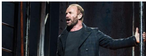
Sting in The Last Ship on Broadway