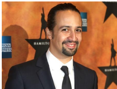
Lin-Manuel Miranda